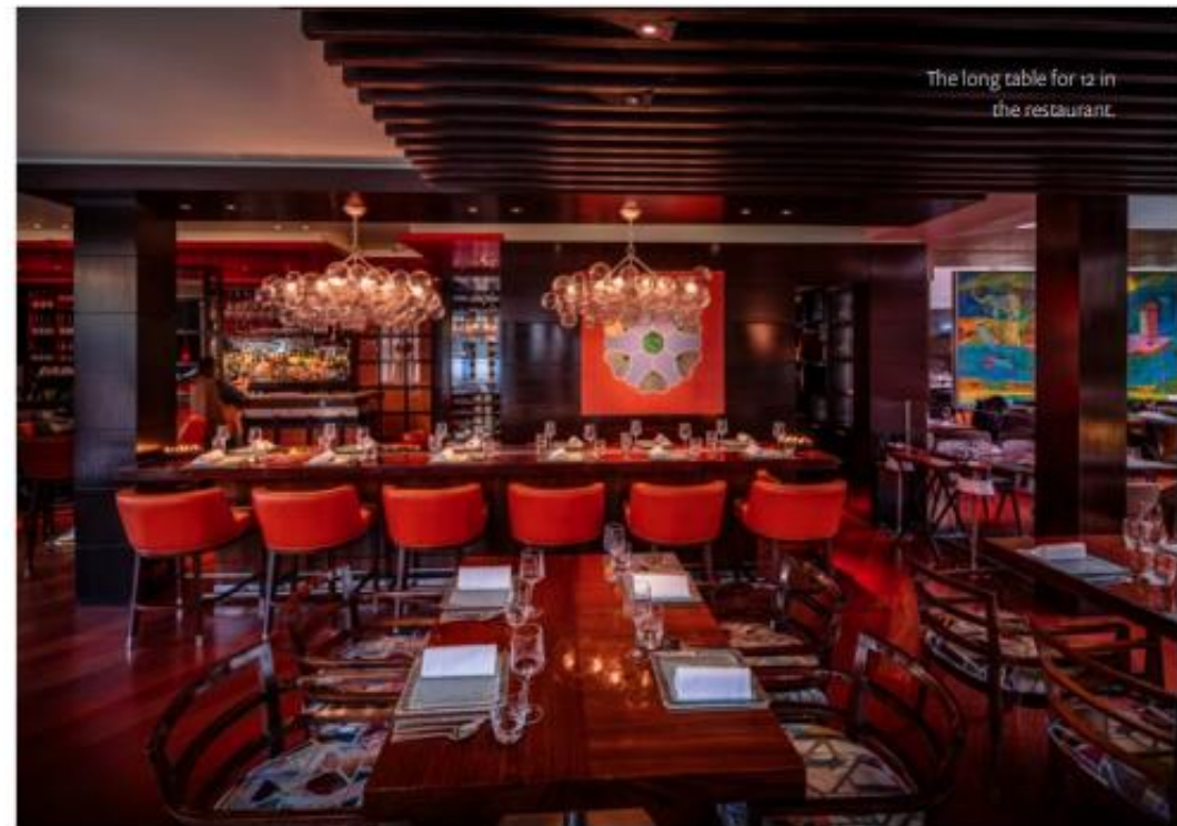
The long table for 12 in the restaurant.