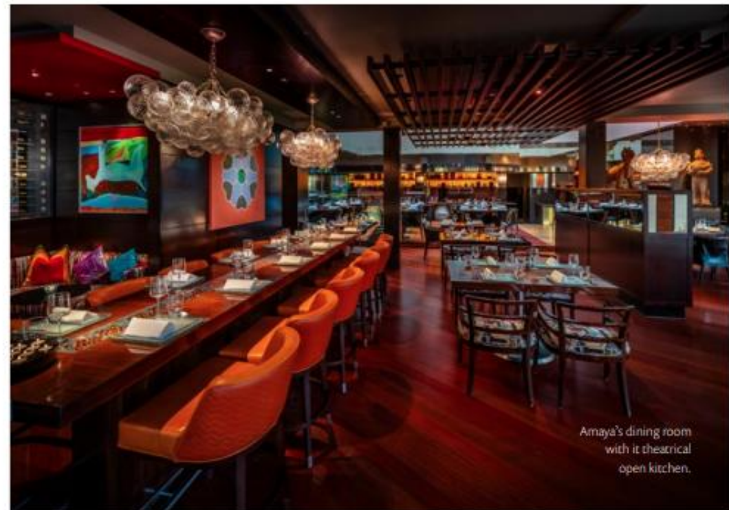
Amaya's dining room with its theatrical open kitchen.