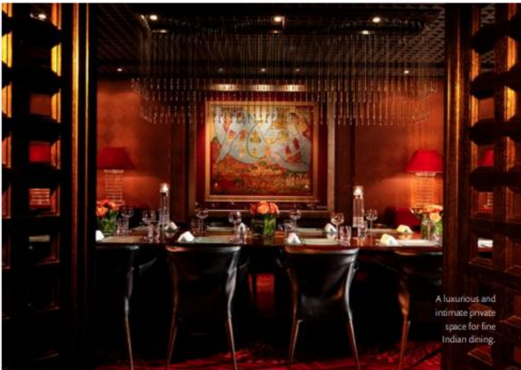
A luxurious and intimate private space for fine Indian dining.