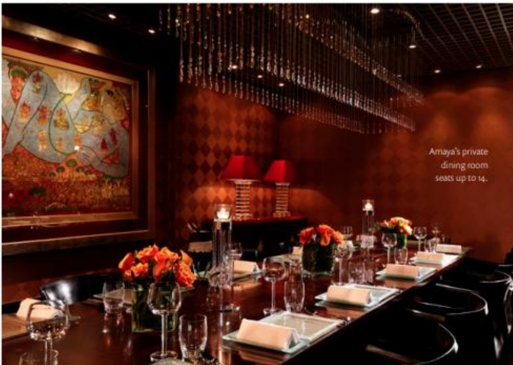
Amaya's private dining room seats up to 14.