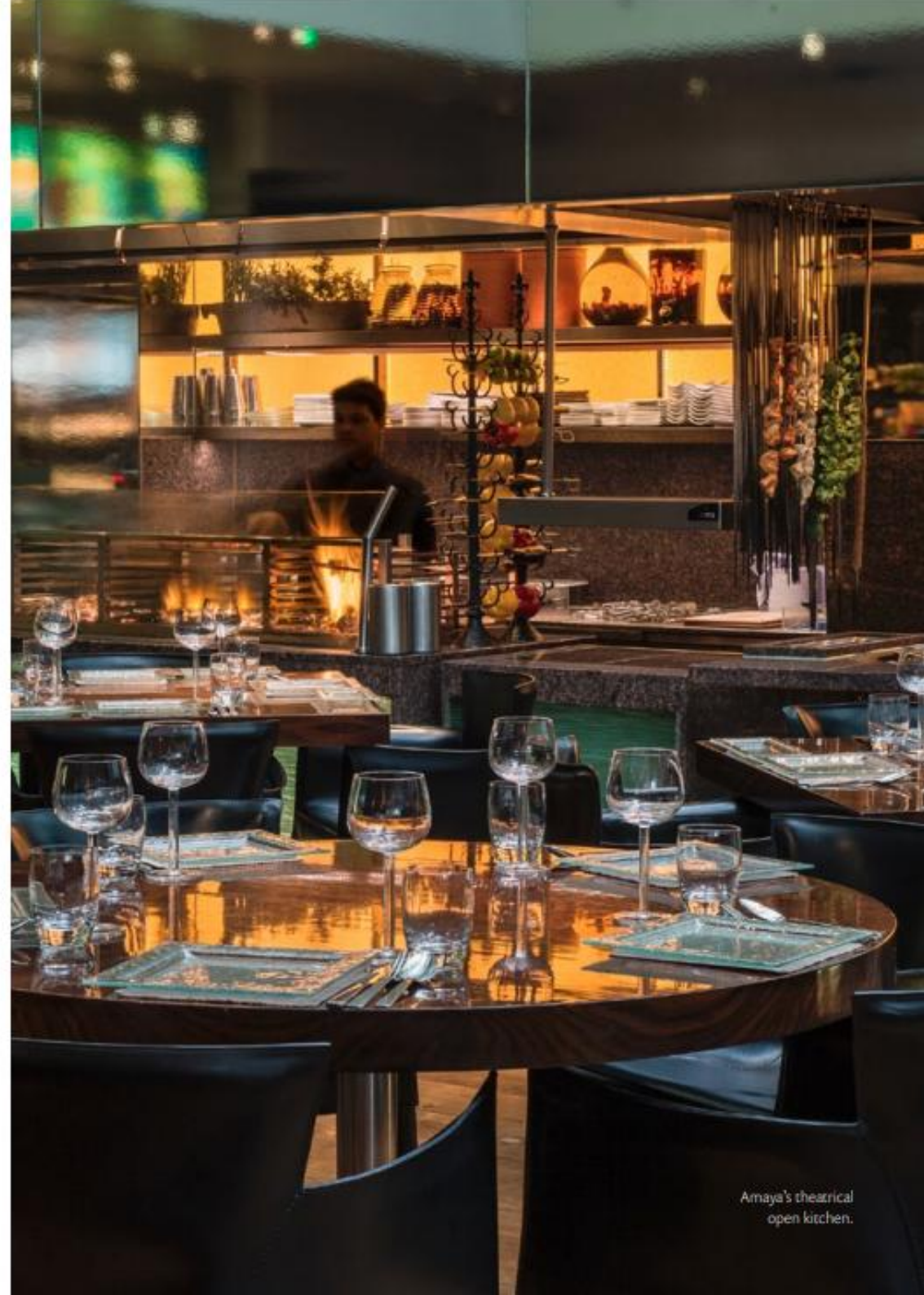
Amaya's theatrical open kitchen.

Halkin Arcade, Belgravia, London SW1X 8JT | privatedining@fineindianrestaurants.com amaya.biz